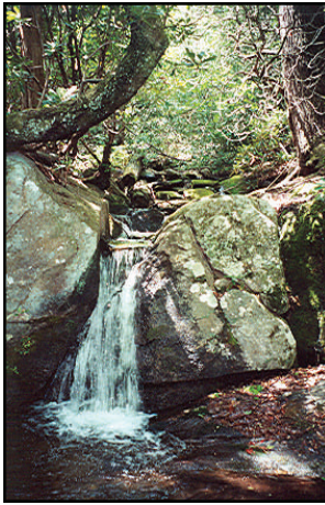
Greybeard Trail waterfall

The Town of Montreat has a distinctive sense of place. Its natural resources and open space make Montreat a desirable place to live. Its character will continue to be defined by a small-town, spiritual atmosphere, natural recreational and educational assets, and heritage going back over one hundred years. Those areas that are vital to Montreat's character should be targeted for protection and careful stewardship.