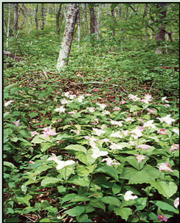
Trillium in Montreat